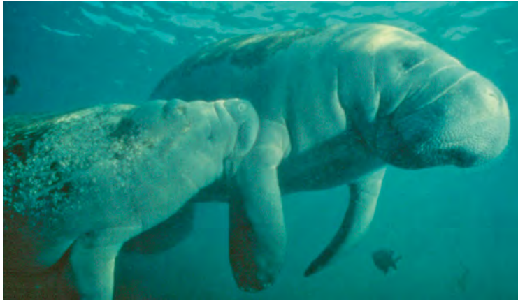
Manatees nurse their young under their flippers.