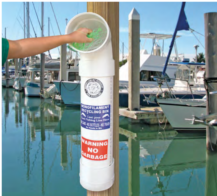
A monofilament line recycle bin

Keep unwanted plastics, monofilament line, rope, and other fishing gear out of the water by discarding them properly in trash or recycle bins provided at many marinas. These items frequently injure, entangle, and kill manatees.