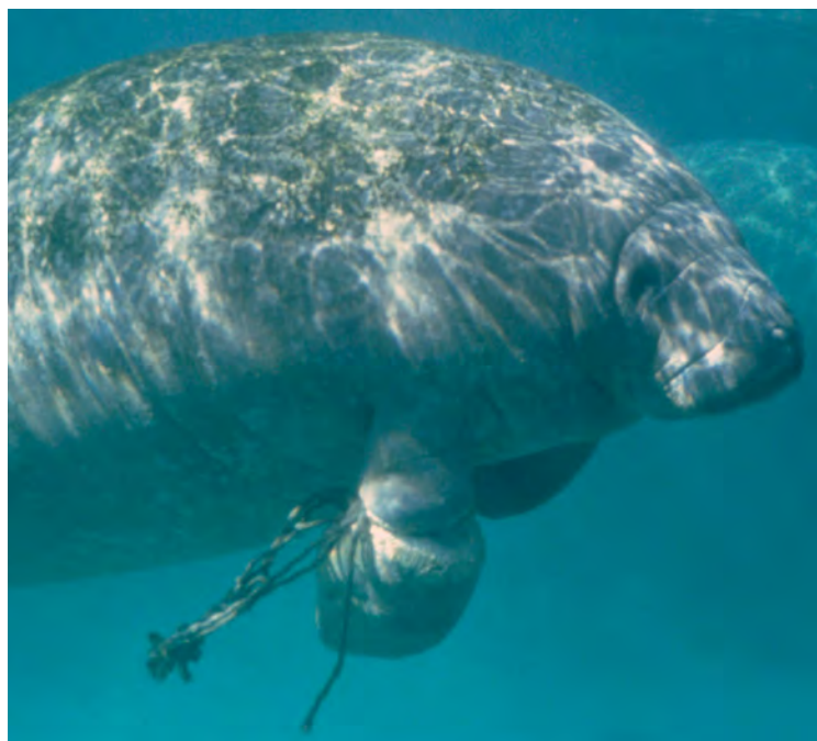
A manatee is tangled in discarded rope.

You will not be cited if you accidentally collide with a manatee while obeying speed restrictions. Please report collisions with manatees, because early rescue efforts may save the manatee's life. In many cases injuries do not kill manatees immediately.