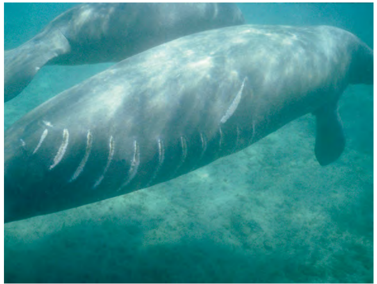
Scars from boat propellers mark this manatee's back.