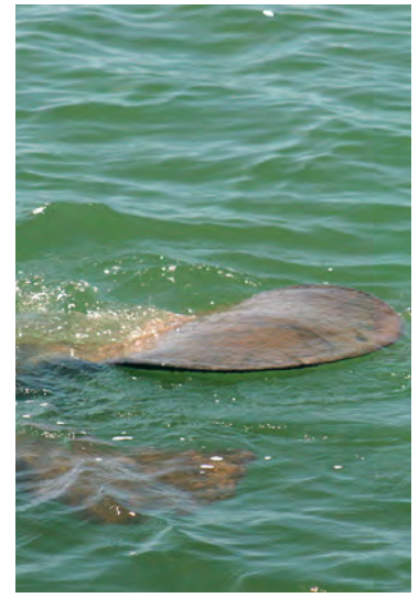
Look for manatee noses, backs, and tails. First photo © Kit Curtin.

Manatees may not always detect approaching boats and also may not be able to successfully evade or avoid a boat that is detected. Some circumstances, such as those listed below, can increase the chances of a manatee-boat collision: