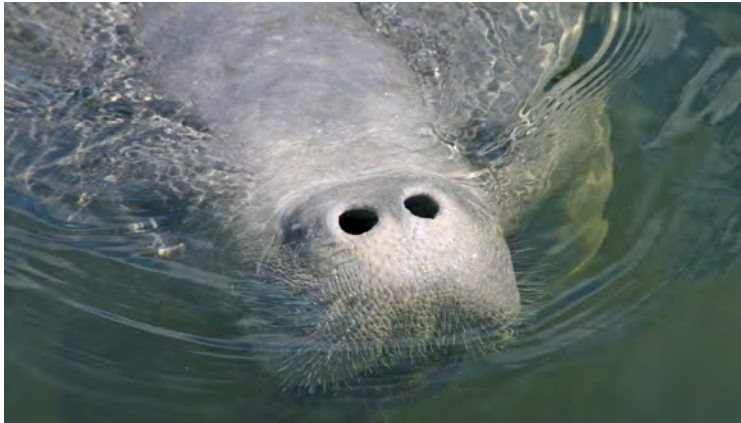
A manatee surfaces to breathe.

Because they are mammals, manatees must breathe air. They typically surface to breathe every two to four minutes, but can stay submerged for 20 minutes or more when resting.