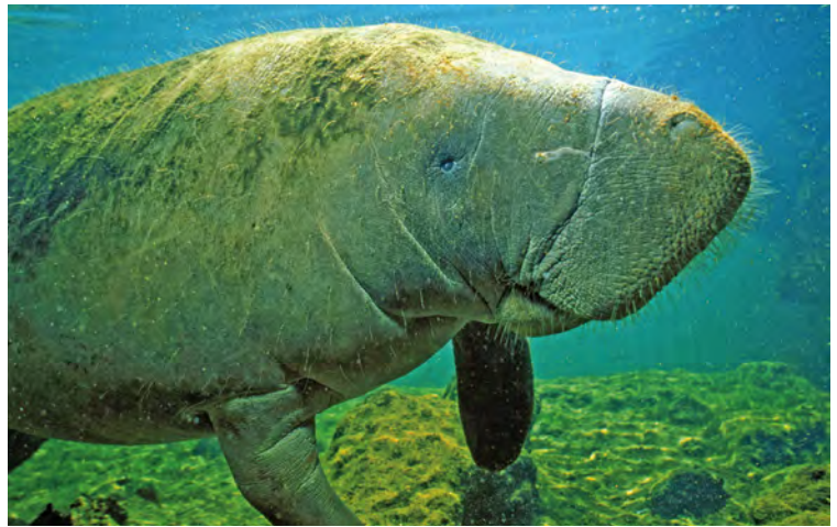
The Florida manatee is the state's official marine mammal.