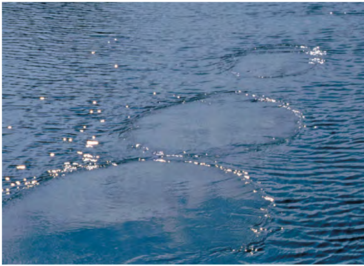
"Manatee footprints" are left by the manatee's tail.